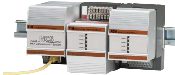
Cost-Effectively Concentrate and Transmit Multiple Process Signals Long Distances on Twisted Wire Pair, Ethernet or Wireless